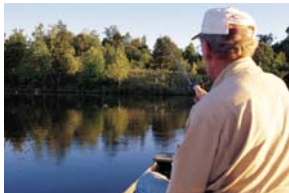
"Klamath River, the River of Renewal"