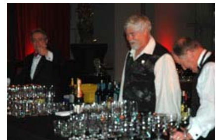
Bar Boys getting ready for the Paaarty...!

Your friends will thank you for inviting them to our exciting "fun"d raiser...! Remember...what happens in Vegas.....! Invitations in the