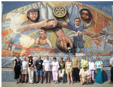
Rotary Polio mural in Mexico, & below, some smiling children..